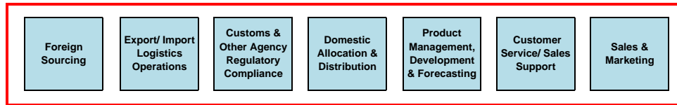
Internal Core Supply Chain Functions

Foreign Vendors, Suppliers and Manufacturers